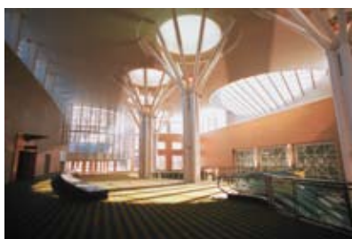
Salt Palace Convention Center

January 18, 2008 is the deadline for money-saving registration discounts for ITEA's Salt Lake City conference , February 21-23, 2008.